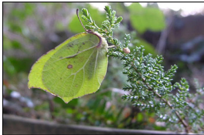
A male Brimstone butterfly overwintering on the steps to the Heathland.

The current mild weather has resulted in a long season for fungi. In the second week of January, a couple of Stinkhorn fungi were seen complete with flies which are drawn to the pungent smell. Despite the torrents of rain over the last few months a solitary Brimstone butterfly is overwintering on a sprig of heather which is growing by the steps to the Heathland Restoration project.