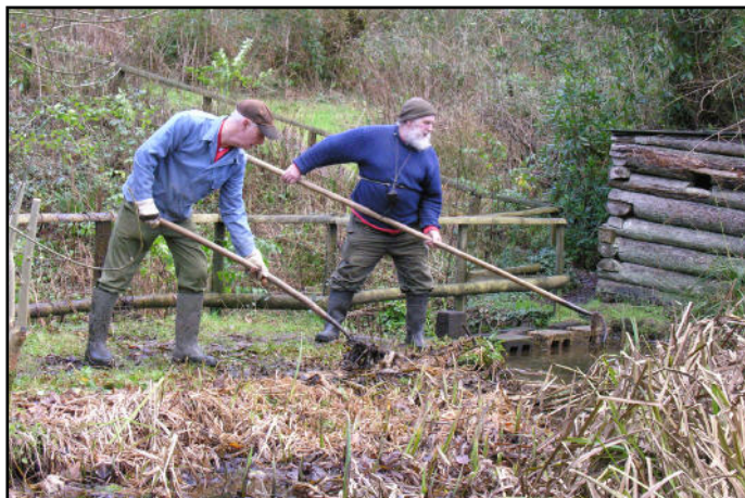
Removing some of the Yellow Iris from the Wetland.

The removal of Yellow Iris includes using long handled rakes to haul the plants out. One would have thought that the disturbance would keep the trout, which live in the wetland, well away. However whilst this work was going on, two trout could be seen within 10 yards of the bank circling each other before charging to attack, their fins breaking the surface of the water. After a short tussle they would resume their