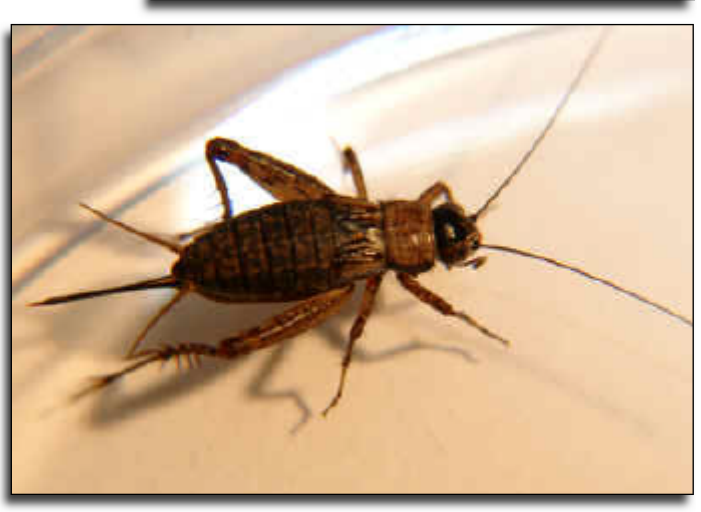
Wood-cricket, a nationally scarce species found at the Centre.

For anybody out there wondering what the term 'biodiversity' in the project title actually means, it is simply a shorthand way of referring to 'the wonderful variety of life in all its forms'. This is very apt when applied to the Centre which contains well over a thousand different species.