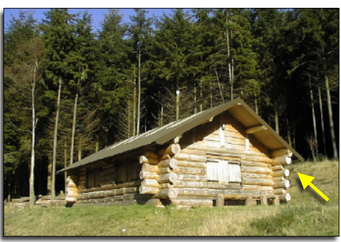
The extension will go behind the cabin.

The launch of the Action for Biodiversity project is benefit financially from the sale of this 'Sat Nav' guided education package to other organisations or businesses which also offer outdoor environmental education to school groups. This will be a significant advance because it will generate income which can be directed wherever it is most needed and which is not tied to a particular project or funding objectives.